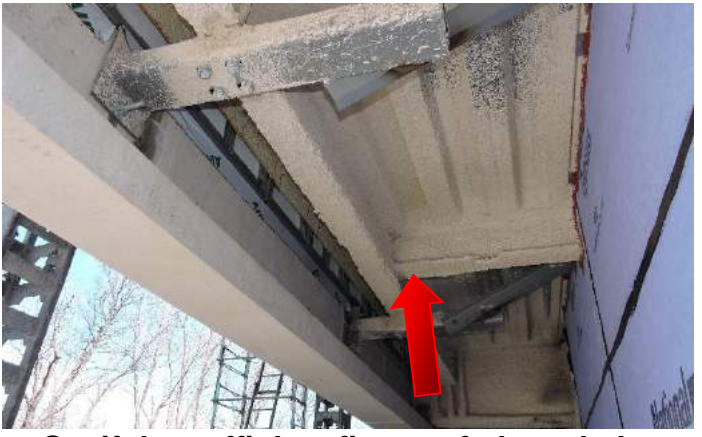
So, if the soffit has fireproofed steel, the team must be able to continue the AVB...somehow...

A solution is to install a secondary soffit to create a proper substrate.