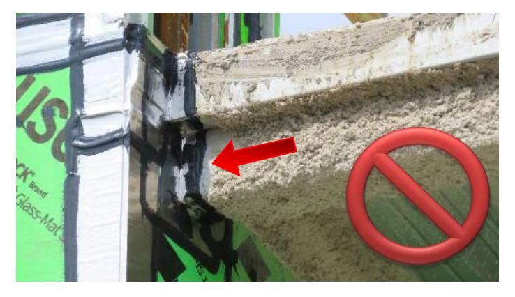
The AVB & SPF cannot be installed on or under fireproofing because it is not a proper substrate as indicated by AVB manufacturers, and has not been fire tested to be on top, and cannot achieve the adequate pull-off strength.

This fact creates a challenging condition for the continuity of the AVB or SPF system(s) when fireproofed structural steel extends out of the exterior wall (line of AVB). The team will need to address how the air/vapor barrier (AVB) or SPF will be continuous.